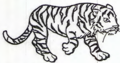
hǔ lǎo hǔ