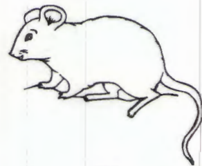
shǔ lǎo shǔ