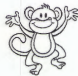
hóu hóu zi