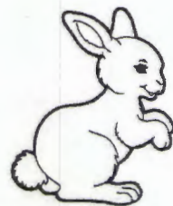
tù tù zi